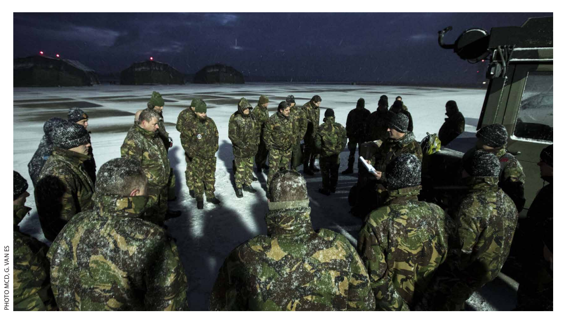
Dutch military personnel, taking part in the Enhanced Forward Presence operations in Lithuania, during a briefing: NATO's military units should constantly remind their soldiers of information warfare threats

rather than new hardware.<sup>55</sup> To meet the challenges, several intelligence recommendations to NATO and its member states can be made.