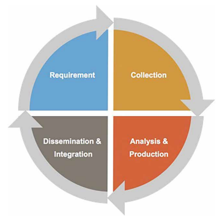
Figure 2 The Intelligence Cycle

be converted into usable information. Intelligence analysts convert raw information into assessments, which in turn result in reports, briefings or other formats in a certain required language. Finally, intelligence reports must be distributed to policy makers and other clients.31 Whether or not the information can be shared with other (member) states depends on the classification of the product. The Intelligence Cycle is indefinite, because answers to requirements lead to new intelligence requirements. Therefore, the cycle is an open-ended stream of information demands and answers to those demands. Lastly, it is important to note that counter-intelligence activities are not incorporated in the cycle. A definition of counter-intelligence will be given in the section below.