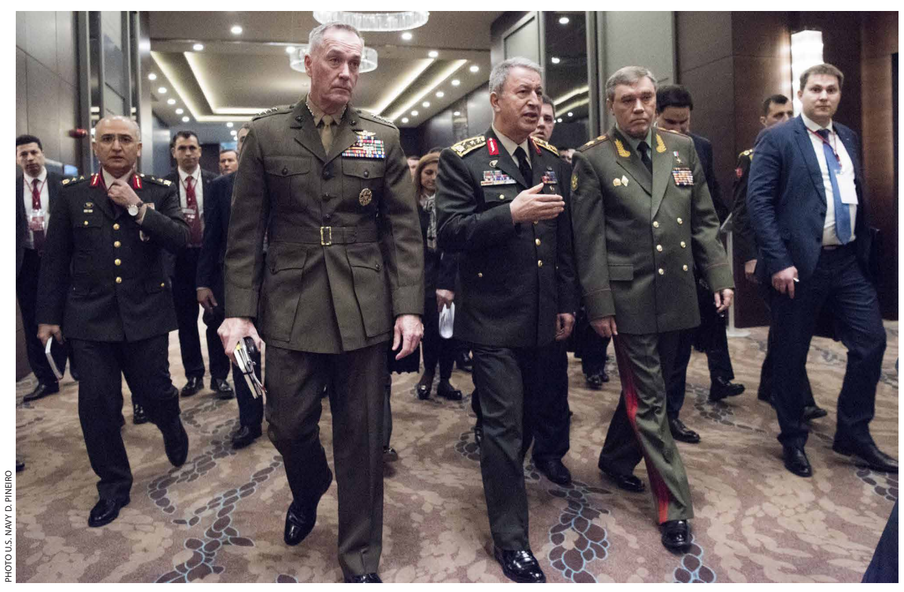
General Valery Gerasimov (right) during talks about operations in Syria with his American and Turkish counterparts Marine Corps General Joseph Dunford Jr. (left), and General Hulusi Akar (centre) (Antalya, March 6, 2017)

In sum, the Gerasimov doctrine appeals to the adaptive use of conventional (military) and especially non-conventional employ of military assets or non-military means in the pursuit of political objectives. This 'new way of war' and its asymmetrical means bypasses or even neutralizes the Western (military) capacities and exploits vulnerabilities of Western societies. It is a way of war that uses political technologies. The role of non-military means in achieving political and strategic goals has grown. 6