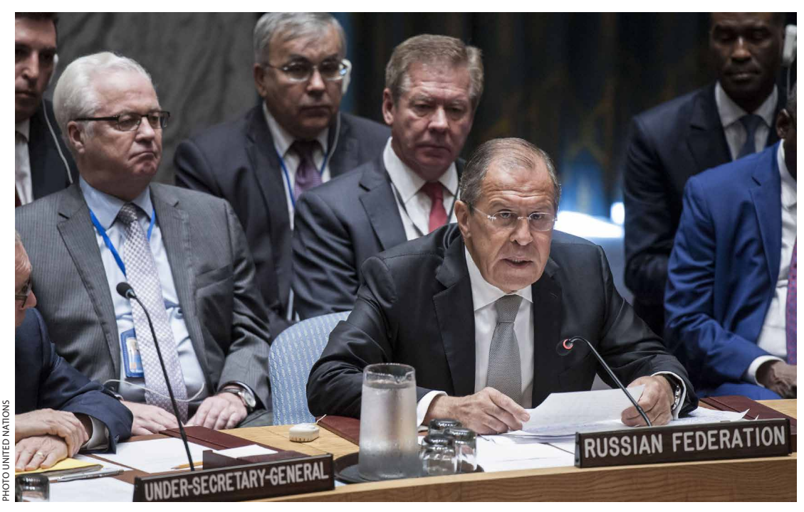
Sergey Lavrov, Minister for Foreign Affairs of the Russian Federation, addresses a high-level UN Security Council meeting: an important goal of the Russian Federation is to remain a key player in the international political arena

nuanced, and accurate understanding of the strengths and weaknesses of this 'new way of war'.27 This is where (counter)intelligence comes into play. Even though the Russian Federation is not in a state of war with NATO or one of its member states, it's more than obvious that an 'intelligence conflict' is ongoing and real. This means that societies as a whole - and intelligence services in particular - have to respond to specific threats on a day-to-day basis. NATO is committed to effective cooperation and coordination with partners and relevant international organizations, in particular the EU, in efforts to counter hybrid warfare.<sup>28</sup> Nonetheless, there are specific vulnerabilities in Western societies that Moscow is eagerly exploiting. The fundamental challenges are to fully understand Russia's capabilities and what they involve and what the deterrence and response options are.<sup>29</sup>