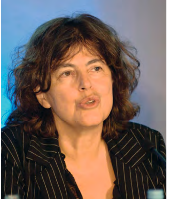
HOTO THEORY TALKS

Critics, most notably Mary Kaldor, have argued that the nature of war has changed in the last decades.<sup>38</sup> As Clausewitz defines war just as 'an act of force to compel our enemy to do our will'<sup>39</sup> it follows that its nature must, according to this simple description, be unchanging.<sup>40</sup> The appearance of the war may, however, change over time. Clausewitz recognized war's ability to change its appearance when he compared war to a chameleon that can adapt its characteristics to a given case.<sup>41</sup> Appearances that are defined by a wide range of contextual factors.<sup>42</sup> Clausewitz said: '...man invented appropriate devices to gain advantage in combat, and these brought about great changes in the forms of fighting. Still, no matter how it is constituted, the concept