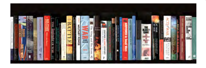
12 Strachan, 'The case for Clausewitz', 48.

First, On War will be briefly introduced by explaining its objective. It will be argued that through its methodology of analysing opposing extremes and its non-prescriptive nature it is an important source for the study of war that itself remains a cornerstone for the education of