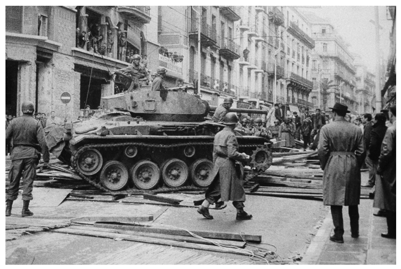
The Algerian War of Independence is an example of asymmetric warfare, of which Clausewitz laid the foundation for modern thinking by examining the relations between a stronger and a weaker adversary and the advantages of the defence over the attack

over the attack. The first book already sets the scene by introducing the idea of 'wearing down the enemy' by using the duration of the war to bring about a gradual exhaustion of his physical and moral resistance. Using one's limited means to the level as to just balance any superiority the opponent may possess, could be enough to make him realise that the political objective in the end is not worth the effort.