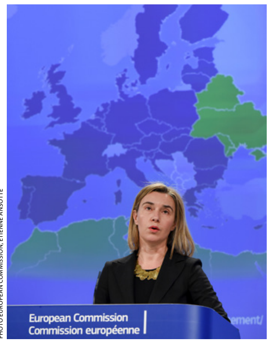
In a speech in 2015, EU High Representative for Foreign Affairs and Security Policy Federica Mogherini pointed at new security challenges posed by the combination of the use of irregular and conventional military methods

This requires a whole-of-government effort wherein the military domain is only one part of the comprehensive solution – yet an indispensable part.<sup>5</sup>