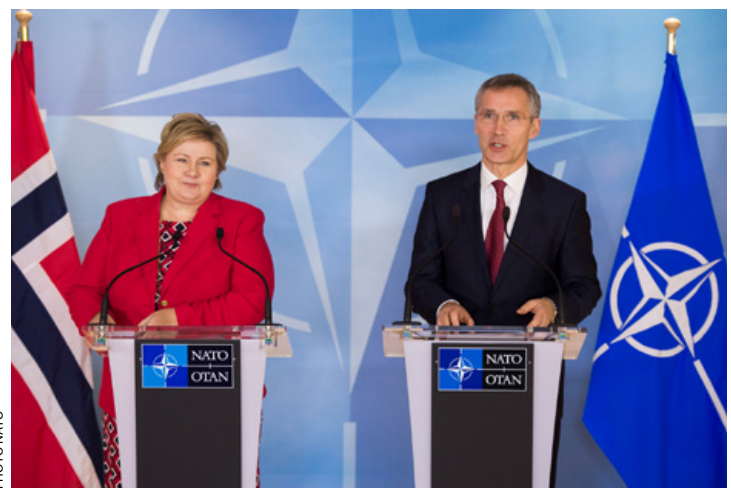
Going back to the core of the NATO Treaty, Norwegian Prime Minister Erna Solberg said the alliance is about military cooperation, but also about democratic and liberal values

the contrary, it can make the alliance stronger instead. That being said, more cohesion is going to be difficult, not in the least because frictions within the EU have caused the pan-European solidarity to crumble.<sup>13</sup> However, without closer cooperation each individual European country is just not able to secure its vital interests. It is important to look again at the core of the NATO treaty. In the words of Norwegian Prime Minister Erna Solberg: 'For me, NATO is not just a military thing; it is also about democratic values, it is about liberal values, it is about the cooperation.'<sup>14</sup> The contemporary crisis within NATO could result in a stronger and betterbalanced alliance, both on the European continent and in the transatlantic sphere. So, though current times are challenging for NATO, they also offer opportunities: NATO could come out of it stronger than before.