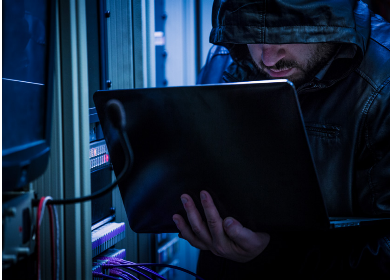
It is clear that when the NATO Secretary General says that 'in the realm of cyberspace, our countries are under attack every single day', prompt action is required

substantially. The German initiative unites the various units and agencies working in the cyber domain under one roof, thus placing the cyber domain next to the land, air and maritime domains. The British approach is more effectcentric, as it aims to bring together influencing capabilities.