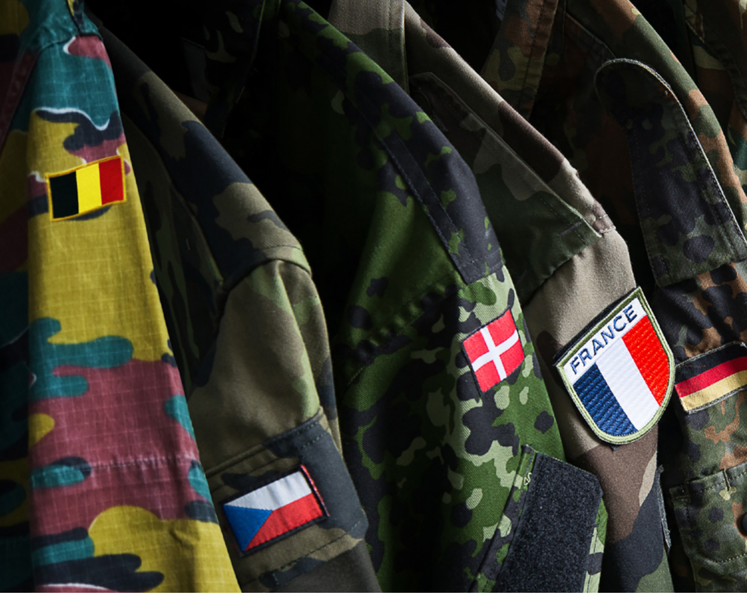
NATO should have the courage to recognise the biggest weakness of it's European member states: the national militaries