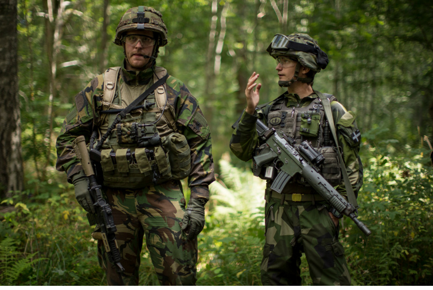
The recently published Dutch army vision puts more emphasis on much closer cooperation with partners, in the national domain as well as internationally