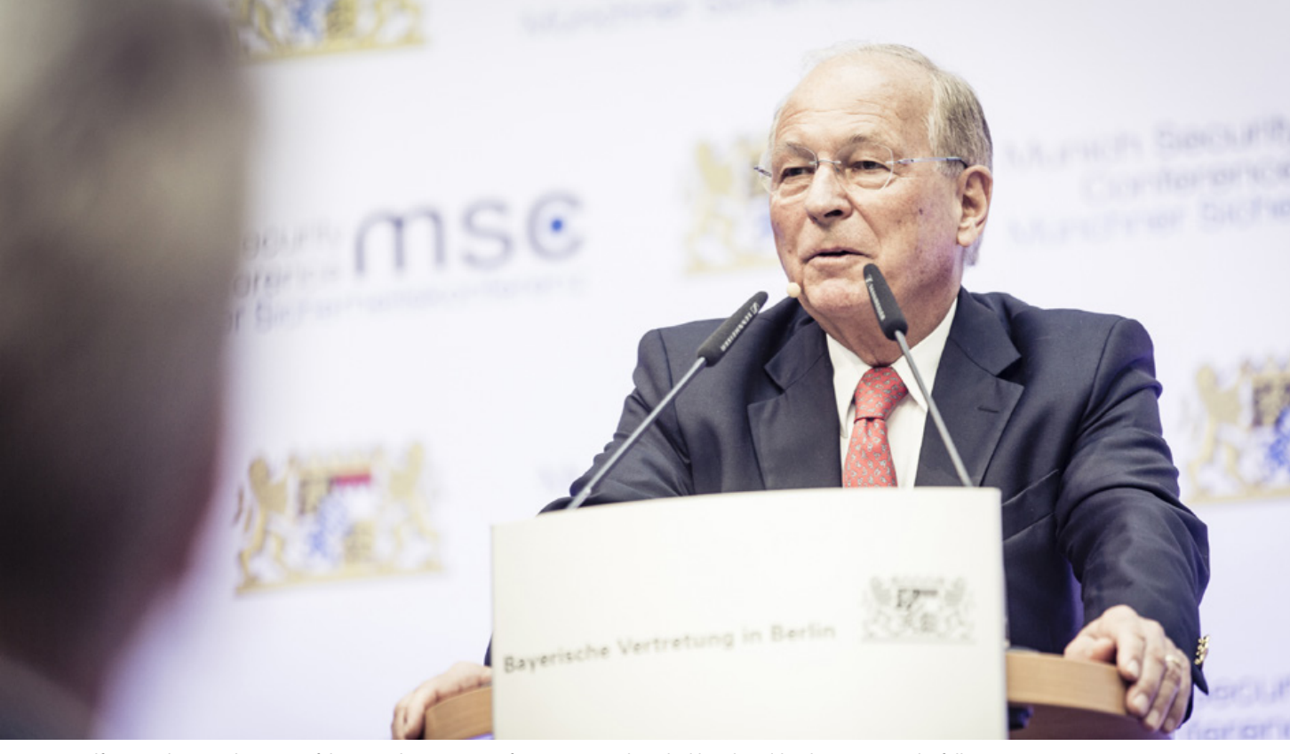
Wolfgang Ischinger, Chairman of the Munich Security Conference, warns that 'the liberal world order appears to be falling apart'

power appears to be gaining the upper hand over soft power. Today we live in a multipolar world, in which a growing number of countries and political leaders seem to believe that international relations are a zero-sum game. This means that the EU, which was built on the power of principles, is increasingly being confronted by the principles of power.'<sup>2</sup>