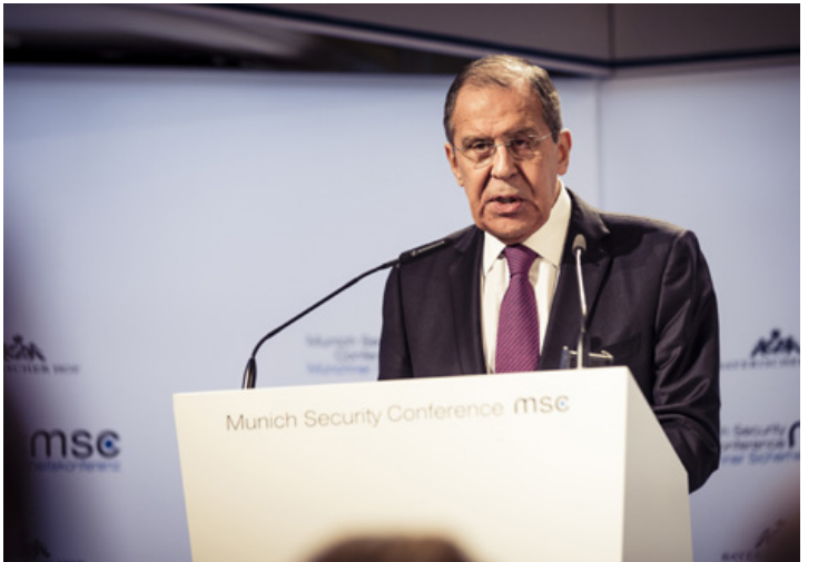
Russian Foreign Minister Sergey Lavrov has noted with regard to the Euro-Atlantic region that 'there appear ever more rifts and the old ones grow deeper'

proven the value of such physical deterrence: one could even argue that the deciding factor in the Cold War was 'deterrence through training'.