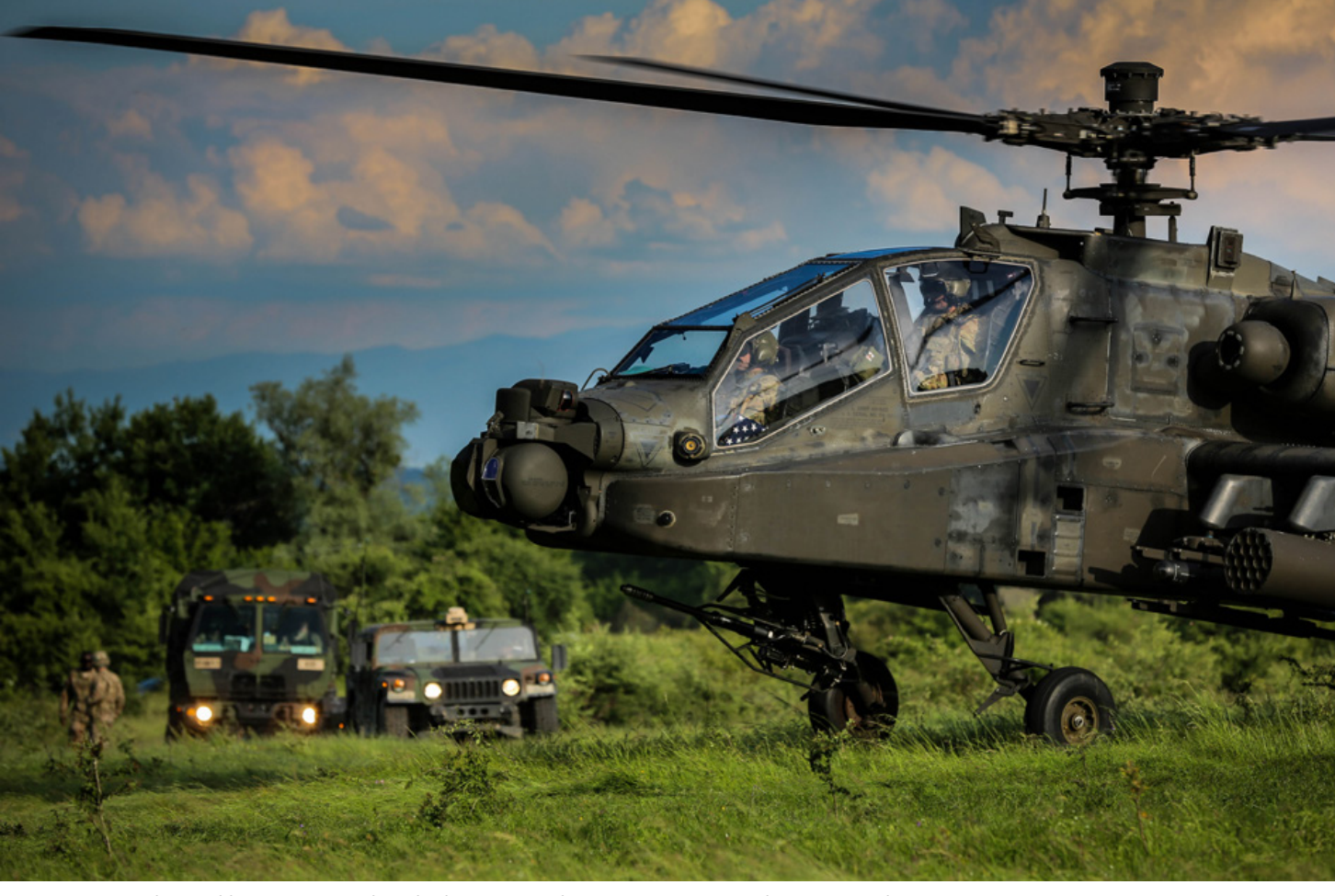
NATO conducts Noble Jump exercises, but why doesn't it consider manoeuvring against the Russian weaknesses?